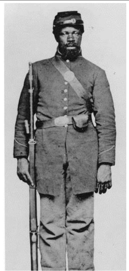
Photo: Unidentified Black Soldier Courtesy of the Wisconsin State Historical Society